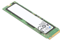
2TB Performance PCIe Gen4 NVMe OPAL2 M.2 2280 SSD