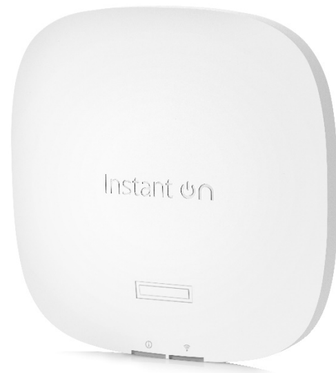
HPE Networking Instant On Access Points AP22

The HPE Networking Instant On Access Points AP22 is our core Wi-Fi 6 access point that gives you the bang for your buck. It hosts a 2x2 antenna array supporting 2 spatial streams with a max aggregate data rate of 1.7 Gbps. The AP22 is ideal for corporate offices, healthcare facilities and hybrid classrooms that require EN certification, or hybrid classrooms. This access point has the same security and reliability as the AP25 at a more attractive price.