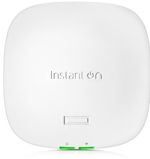
HPE Networking Instant On Access Points AP21

The HPE Networking Instant On Wi-Fi 6 family has the right access point to fit your business needs. From cost-effective single room streaming to conference room collaboration to exhibition hall environments, our wireless solutions make your network accessible and efficient.