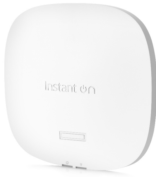
HPE Networking Instant On Access Points AP25

The HPE Networking Instant On Access Points AP25 is our top performer, with a 4x4 antenna array that supports 4 spatial streams to provide coverage and speed in device-dense networks, and is best if used in common areas where 100 or more of your customers can gather. The AP25 2.5GbE uplink port enables more network bandwidth to support the wireless maximum 5.3Gbps throughput for connected clients compared to traditional 1GbE uplink in other Wi-Fi 6 access points.