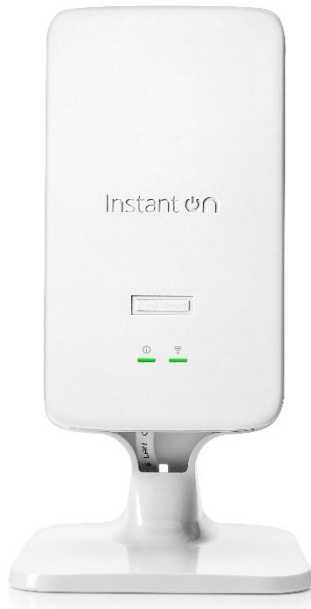
HPE Networking Instant On Access Points AP22D

The HPE Networking Instant On Access Points AP22D is the more versatile version of the AP22. It has the same antenna array and spatial streams (2x2:2) but has a 2.5GbE uplink port and four 1GbE downlink ports for hardwired devices. The AP22D can also supply Power over Ethernet (PoE) to two of the downlink ports at 15W (PoE 802.3af) when powered with Class 6 PoE 802.3bt or the optional DC power supply. When powered by Class 4 PoE 802.3at, the AP22D will supply power to one port at 15W (PoE 802.3af). This makes the AP22D great for IP phones or receipt printers in areas that need more Ethernet ports and only one in-room Ethernet port is available. Great for boutique hotel rooms, home offices, or reception areas.