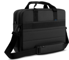
Dell EcoLoop Pro Briefcase - CC5623

Elevate your video conferencing experience with the world's best image quality 4K webcam that optimizes your visuals with a large 4K Sony STARVIS™ CMOS sensor and AI Auto-Framing.