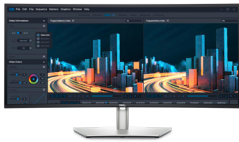
Dell UltraSharp 34 Curved USB-C Hub Monitor - U3421WE

Get immersive productivity on a 34" WQHD curved monitor with a wide color coverage and extensive connectivity including RJ45, USB-C and quick-access front ports.