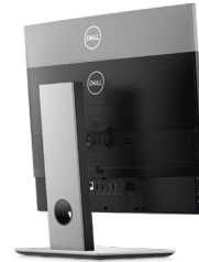
OPTIPLEX 5270 ALL-IN-ONE HEIGHT ADJUSTABLE STAND

Tilt your display forward, backward, or recline to a 60 degree angle. This stand makes touchscreen interaction comfortable.