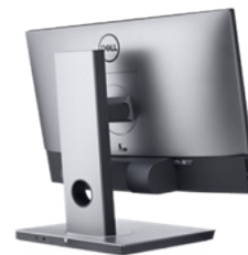
OPTIPLEX ALL-IN-ONE PORT COVER

In this custom Height Adjustable Stand, a DVD+/-RW is integrated into the base of the stand for optimal convenience.