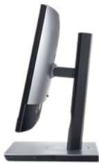
OPTIPLEX 5270 ALL-IN-ONE DVD+/-RW IN HEIGHT ADJUSTABLE STAND

Raise, tilt, pivot or swivel your All-In-One with a stand that delivers personalized comfort and viewing angles.