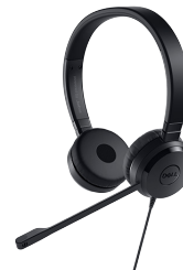
DELL PRO STEREO HEADSET - UC350

The smart choice for dual-display productivity with a 21.5" screen, full range of adjustable features, slim borders, and multiple connectivity points.