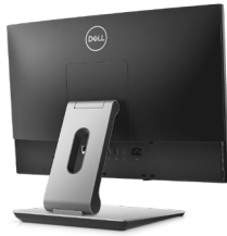
OPTIPLEX 5270 ALL-IN-ONE ARTICULATING STAND

Tilt your display forward, backward, or recline to a 60 degree angle. This stand makes touchscreen interaction comfortable.