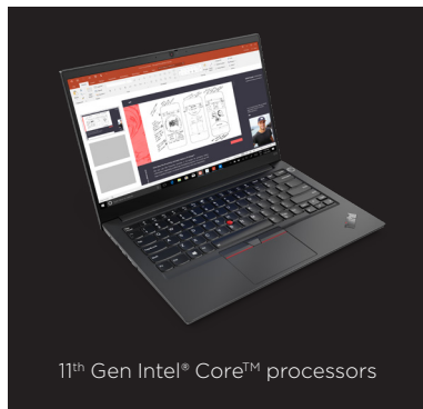
11 th Gen Intel® Core™ processors