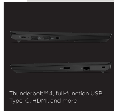
Thunderbolt™ 4, full-function USB Type-C, HDMI, and more