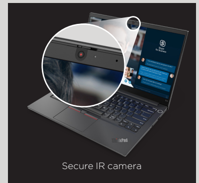
Secure IR camera