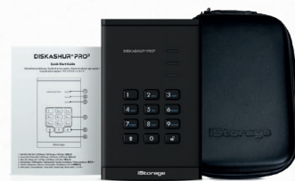
diskAshur PRO 3 portable HDD/SSD, Carry Case and Quick Start Guide