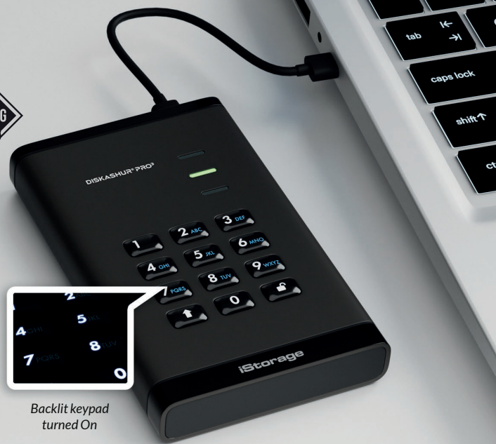
Backlit keypad turned On

In a world where safeguarding your valuable data is a priority, the iStorage diskAshur PRO 3 is the ultimate choice for ensuring top-of-the-line data security.