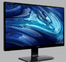
23.8" Antimicrobial 360 Monitor KE2 series