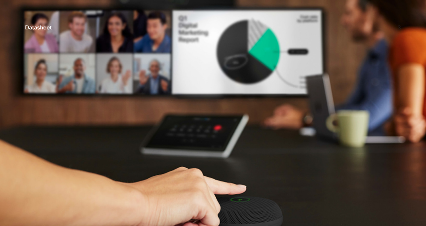
Figure 1. The carbon black Cisco Table Microphone Pro on a meeting room table connected to the Room Bar Pro.