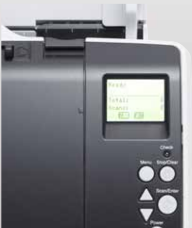
Integrated backlight enhanced LCD operating panel

A backlight enhanced LCD screen within the operating panel puts instant information at your fingertips, including scanner settings, operating status, interaction hints and a paper counter. Also, selecting from the user panel pre-defined scanning routines created with the powerful PaperStream Capture solution included in the package, is a breeze.