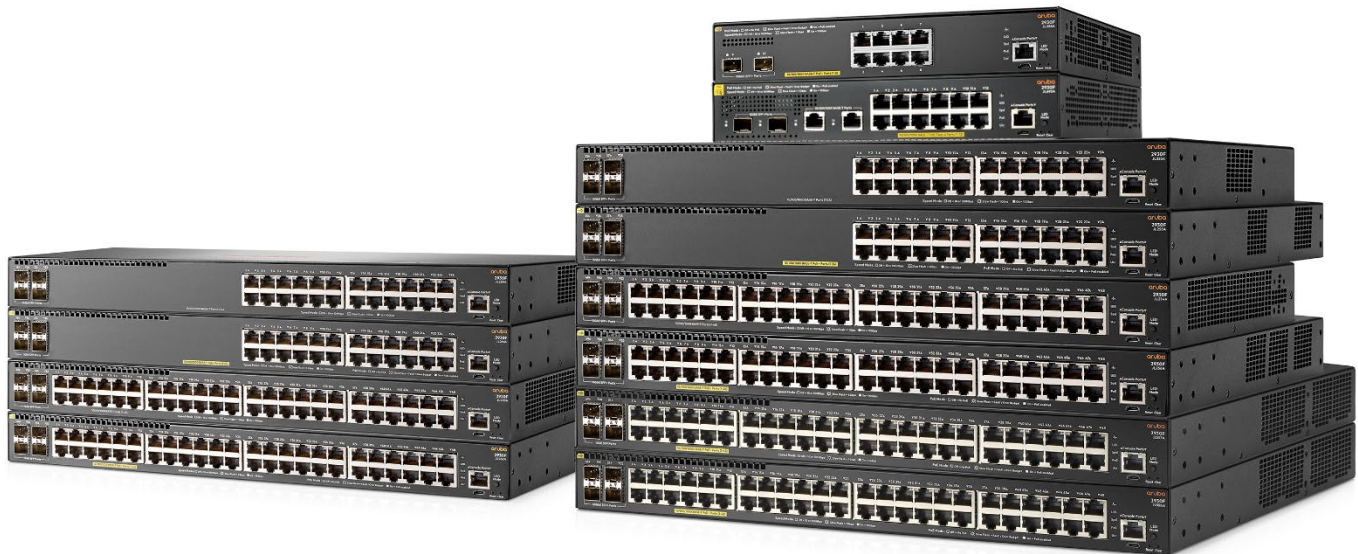
Aruba 2930F Switch Series

The Aruba 2930F Switch Series provides a convenient and cost-effective access switch solution that can be quickly set up with Zero Touch Provisioning. The robust basic Layer 3 feature set includes a limited lifetime warranty.