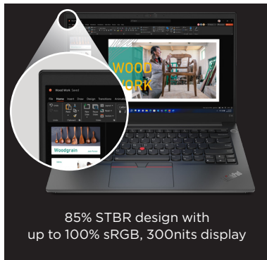
85% STBR design with up to 100% sRGB, 300nits display