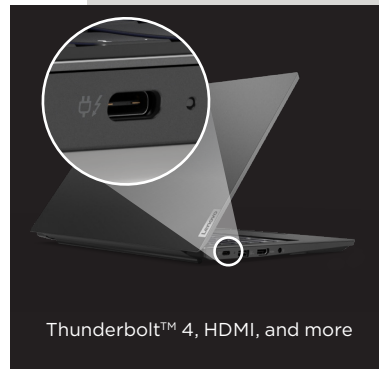
Thunderbolt™ 4, HDMI, and more