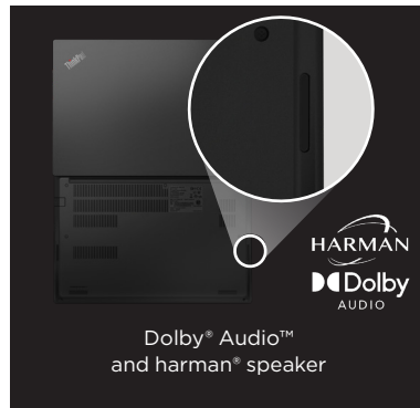
Dolby® Audio™ and harman® speaker