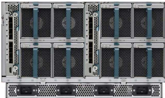
Figure 2. Rear of Cisco UCS 5108 Blade Server Chassis with Two Cisco UCS 2208XP Fabric Extenders Inserted

Cisco UCS 2200 Series Fabric Extenders fit into the back of the Cisco UCS 5100 Series chassis. Each Cisco UCS 5100 Series chassis can support up to two fabric extenders, allowing increased capacity and redundancy (Figure 2).