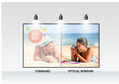
Optical bonded PCAP

The ProLite T2752MSC-B1AG with its Full HD (1920x1080) resolution and with IPS panel technology offers exceptional colors and wide viewing angles. The Optical Bonded Projective Capacitive (PCAP) 10-point touch technology ensures a seamless and accurate touch response and a lower light reflection, in addition, the display is protected against humidity and potential moisture development. A special Nano coating ensures a smoother touch and less resistance in the swipe. It makes the screen less static and susceptible to dirt, dust and fingerprints. The flexible stand can be positioned at several angles creating a comfortable and ergonomic user experience and the integrated cable management system hides all the cables and electrical wires giving a neat and cable-free workspace. The Anti Glare coating helps to avoid issues with reflections and external light sources affecting colour reproduction, contrast and sharpness. A perfect choice for a vast array of applications.