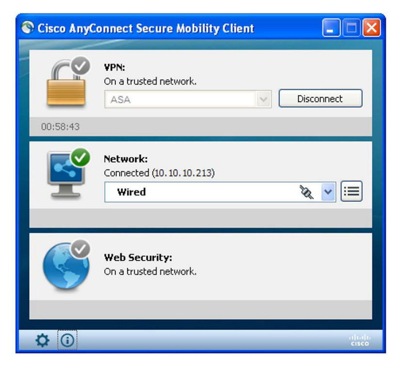
Figure 2 shows a VPN configuration on Apple OS X.