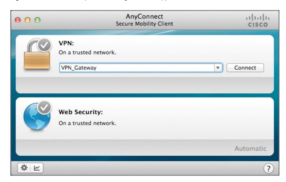
Figure 2. Icon and Sample VPN Configuration on Apple OS X