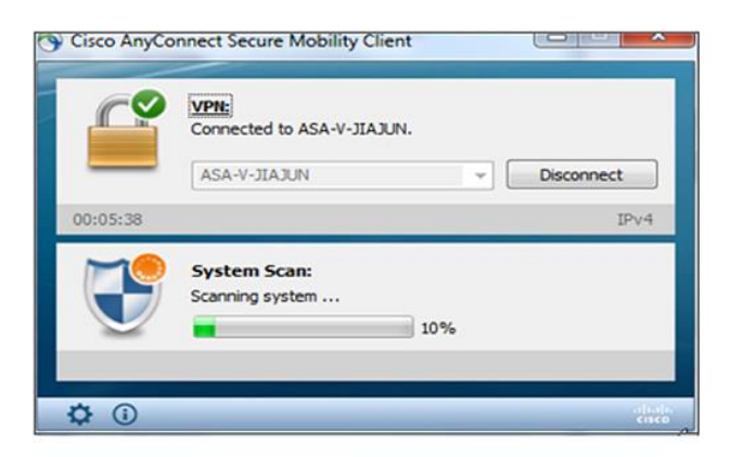
Figure 3. Endpoint Compliance Checks

Figure 3 shows the AnyConnect unified endpoint compliance across wired and wireless environments.