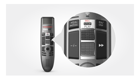
Slide-switch operation (record, stop, play, fast rewind)