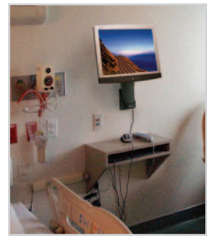
Use in spaceconstrained areas of patient rooms.

Position the height and angle of an LCD or Tablet PC for maximum comfort with Constant Force (CF<sup>™</sup>) proprietary lift-and-pivot motion technology.