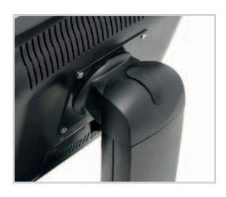
Attach your LCD to the wall lift with four screws.