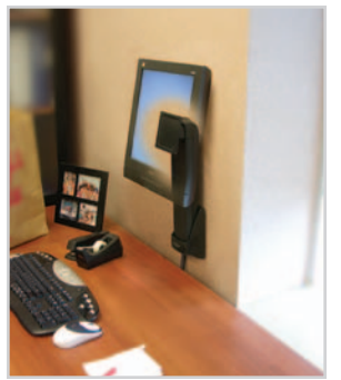
Perfect for use in the home where counter space can be at a premium.

Position the height and angle of an LCD or Tablet PC for maximum comfort with Constant Force (CF<sup>™</sup>) proprietary lift-and-pivot motion technology.