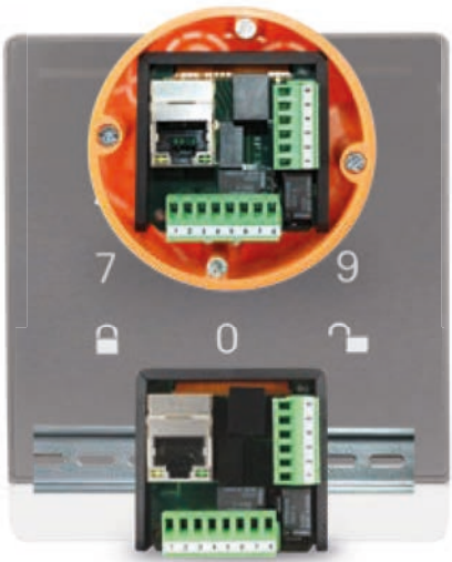
Mounting example in 60 mm switch box and DIN rail

The StarterSet consists of an IP wall reader, an Access Manager SmartRelay and an RFID token. This set can be combined with an additional extension reader (only IP wall reader without SmartRelay) to integrate another door into the system. With the extension reader, the power supply is also provided directly via the SmartRelay.