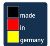
Made in Germany