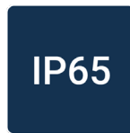
IP65 (front side)