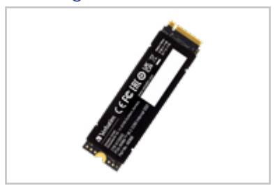
Back Angled 2