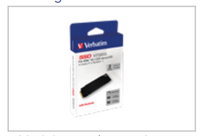
49368 2TB Packaging 3D