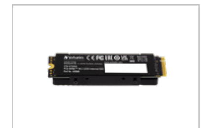
Back Angled 1