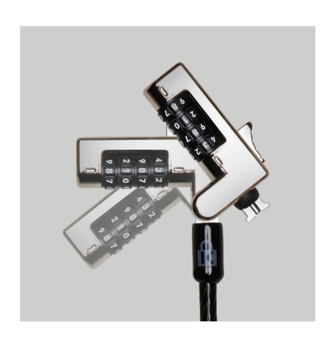
Pivot and Rotate Cable Head Featuring One-Handed Operation

Expanding side "hooks" grab the internal sides of the lock slot, creating a strong connection between the device frame and the lock to resist and deter theft.