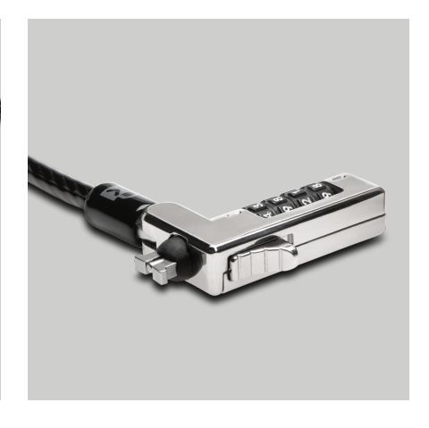
Unique Lock Engagement

Verified and tested for industry-leading standards in torque/pull, foreign implements, lock lifecycle, corrosion, and other environmental conditions. Carbon steel cable resists cutting attempts, and anchors to desks, tables and other attachment points.