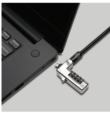
Tough Lock Head and Cable

Slim lock head won't raise your device off its surface.