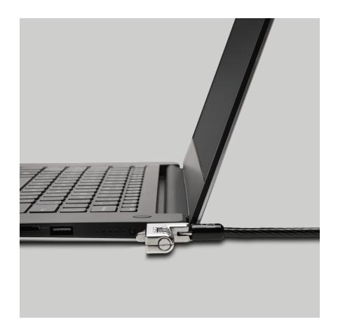
Allows Ultra-Thin and 2-in-1 Laptops to Lie Flat and Stable

Slim Combination Laptop Lock (Resettable) – Part Number: K60600WW | UPC Code: 0 85896 60600 0 Slim Combination Laptop Lock (Serialised 25-pack) – Part Number: K60602WW | UPC Code: 0 85896 60202 4