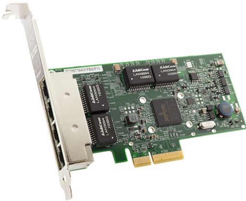
Figure 1. Broadcom NetXtreme I Quad Port GbE Adapter

Figure 1 shows the Broadcom NetXtreme I Quad Port GbE Adapter.