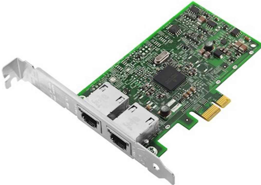
Figure 2. Broadcom NetXtreme I Dual Port GbE Adapter

The following figure shows the Broadcom NetXtreme I Dual Port GbE Adapter