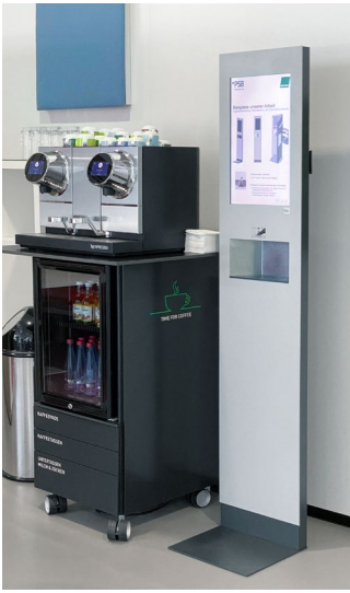
DAT 1000 in a coffee corner