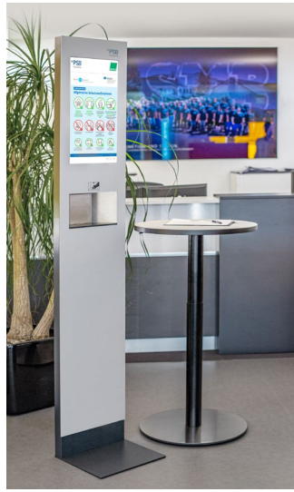
DAT 1000 in a customer waiting area