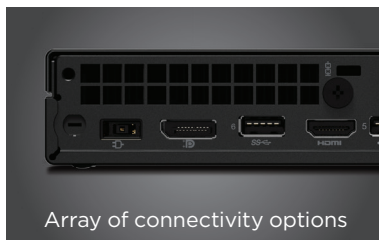
Array of connectivity options