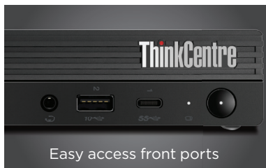
Easy access front ports

Lenovo's dedication to constantly improving product quality means rigorous testing for durability and reliability, which results in our products achieving one million hours mean time between failure. In addition to our extensive in-house testing for real-world challenges.