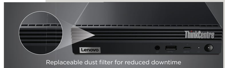
Replaceable dust filter for reduced downtime