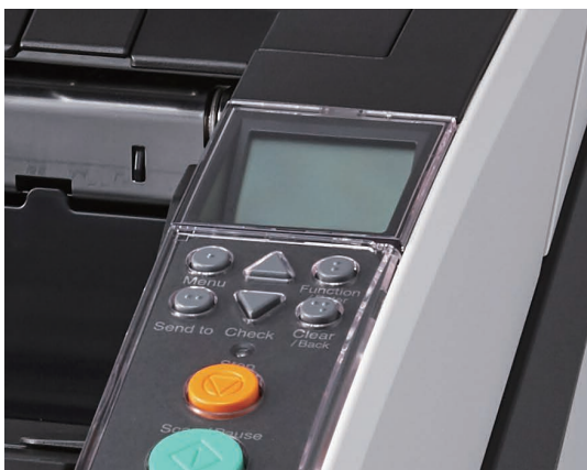
Integrated LCD operating panel

Ricoh's fi-7800 and fi-7900 deliver the complete scanning solution. A combination of our market-leading scanner, software and service give you everything needed for a more productive system and more productive people, allowing you to focus more on your business and less on your technology.