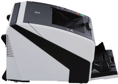
fi-7800 – A4 Landscape at 300 dpi 110 ppm / 220 ipm fi-7900 – A4 Landscape at 300 dpi 140 ppm / 280 ipm Scan mixed batches through the 500 sheet ADF