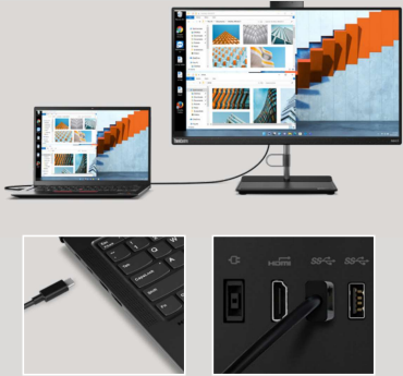
SMART CABLE 1 (PN: SC11D96395 / SC11D96396)

This portable plug-and-play cable enhances desktop computing and storage sharing capability to work seamlessly between two computing devices. Smoothly operate two devices within one device screen—switch each device within the same screen with full right to access, copy, move, delete, edit, save, and close applications. Transfer pictures, videos, and files with a simple drag-and-drop, using just one keyboard and mouse.