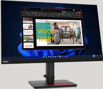
THINKVISION T27q-20 MONITOR 2 (PN: 61EDGAR2WW)

This portable plug-and-play cable enhances desktop computing and storage sharing capability to work seamlessly between two computing devices. Smoothly operate two devices within one device screen—switch each device within the same screen with full right to access, copy, move, delete, edit, save, and close applications. Transfer pictures, videos, and files with a simple drag-and-drop, using just one keyboard and mouse.