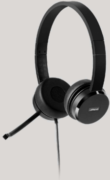
LENOVO 100 STEREO USB HEADSET 2 (PN: 4XD0X88524)

Connect both keyboard and mouse seamlessly using a wireless 2.4 GHz dongle. The spill-resistant, wireless keyboard with low profile island-style keys and adjustable tilt leg is responsive and easy to use. The full-size wireless mouse accommodates left- and right-handed users with an ambidextrous design, and 1200 DPI resolution gives more precision and control. It comes with a one-year warranty.