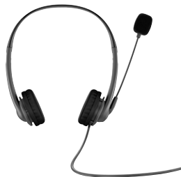
HP Stereo USB Headset G2