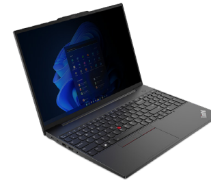
ThinkPad P16/T16/E16 Gen1