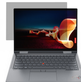
X1 Yoga Gen6