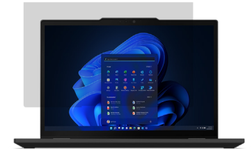
ThinkPad X13 Yoga Gen 4