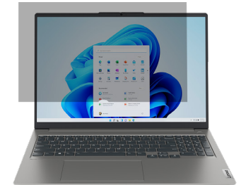
ThinkBook 16 Gen 4+ / Gen 5+