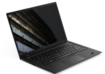
X1 Carbon Gen9