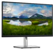
Dell 27 Monitor - P2723D

Stay focused on a 27-inch QHD monitor optimized to deliver high performance details and clarity.