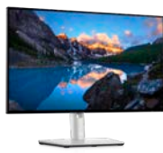
Dell UltraSharp 24 USB-C Hub Monitor - U2422HE

Stay focused on a 27-inch QHD monitor optimized to deliver high performance details and clarity.