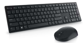
Dell Pro Wireless Keyboard and Mouse - KM5221W

Multi-task seamlessly across 3 devices, featuring programmable shortcuts and 36 months battery life.