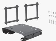
HP Desktop Mini v4+ VESA Sleeve

Wrap your HP Desktop Mini PC in the HP Desktop Mini v4+ VESA Sleeve to securely mount it—with or without an Expansion Module 1,2 —behind your display, position the solution on a wall, and lock it down with the integrated security bracket and optional HP Ultra-Slim Cable Lock.