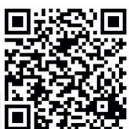
V110 3D Demo