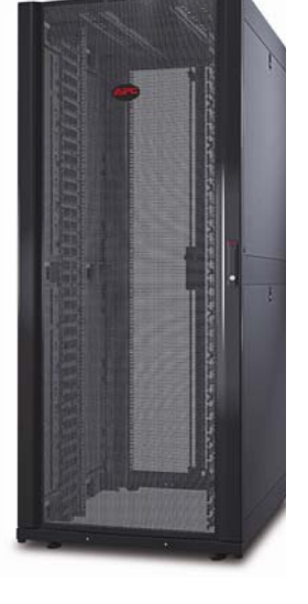
AR3340 – 42U Height AR3347 – 48U Height