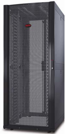
AR3340 – 42U Height