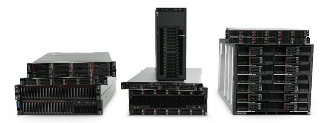
Figure 1. ThinkSystem servers include the XClarity Controller integrated service processor

Lenovo ThinkSystem servers contain an integrated service processor, XClarity Controller (XCC), which provides advanced service-processor control, monitoring, and alerting functions. The XCC consolidates the service processor functionality, super I/O, video controller, and remote presence capabilities into a single chip on the server system board. The XCC is based on the Pilot4 XE401 baseboard management controller (BMC) using a dual-core ARM Cortex A9 service processor.