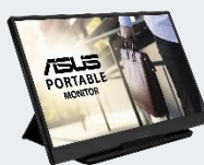
ZenScreen MB 165B