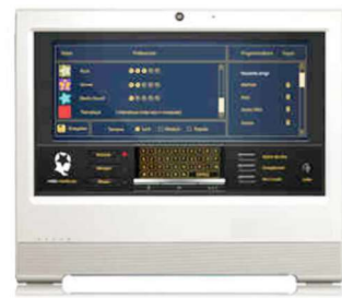
POS Radio Playing advertising and music