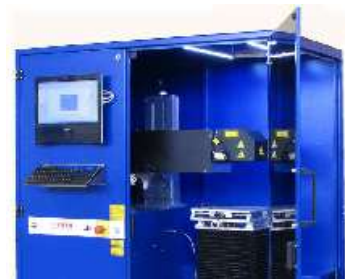
Visualisation e.g. for industrial production machines