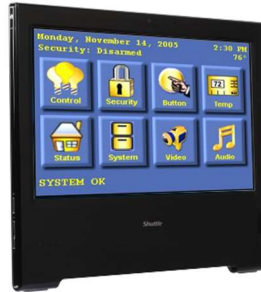
Smart Home Control Surveillance, Home Automation