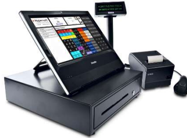
POS Checkout system in Retail Stores, Restaurants, Hotels