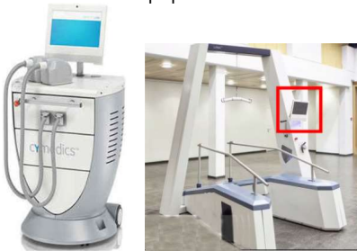
Device Control e.g. for health services or fitness equipment