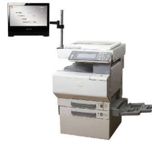
Device Control e.g. for copy machines