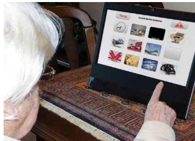
Communication Device e.g. for the elderly