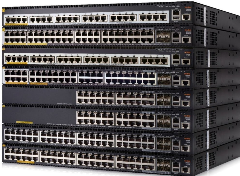
Aruba 2930M Switch Series

The Aruba 2930M Switch Series provides a simple and powerful access layer solution that can be quickly set up at branch offices with little or no IT support using Zero Touch Deployment. The switches include a Limited Lifetime Warranty.