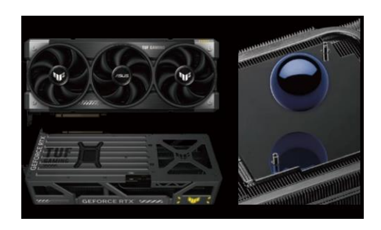
*For illustration only

ASUS MaxContact design, a vapor chamber and a vented backplate optimized for airflow work in tandem with Axial-tech fans to drive air through the entire array, keeping noise levels down and GPU temperatures under tight control.