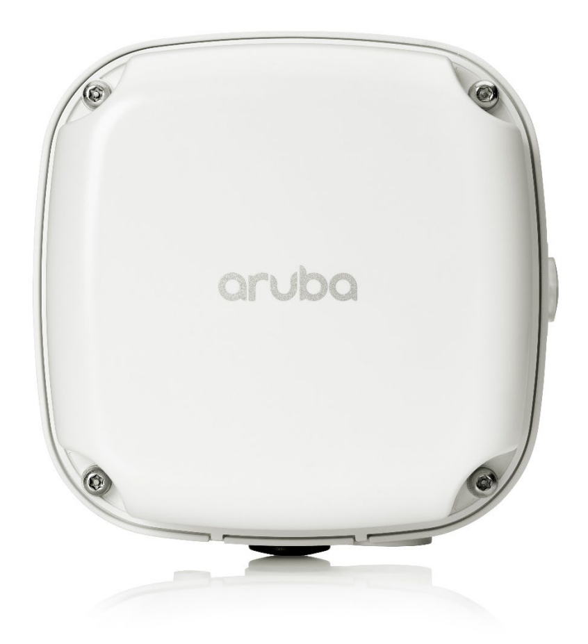
Aruba 560 Series Outdoor Access Points

The Aruba advanced ClientMatch technology and an integrated Bluetooth beacon can help enable Aruba location services.