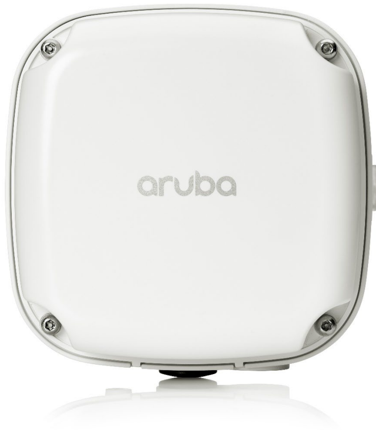
Aruba 560 Series Outdoor Access Points

The Aruba advanced ClientMatch technology and an integrated Bluetooth beacon can help enable Aruba location services.