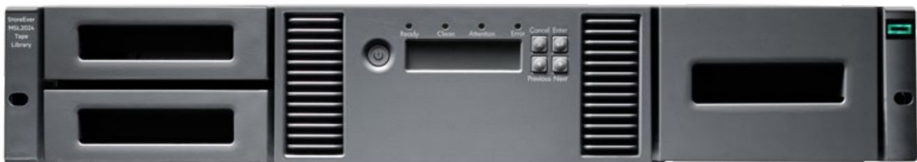
HPE StoreEver MSL2024 Tape Library