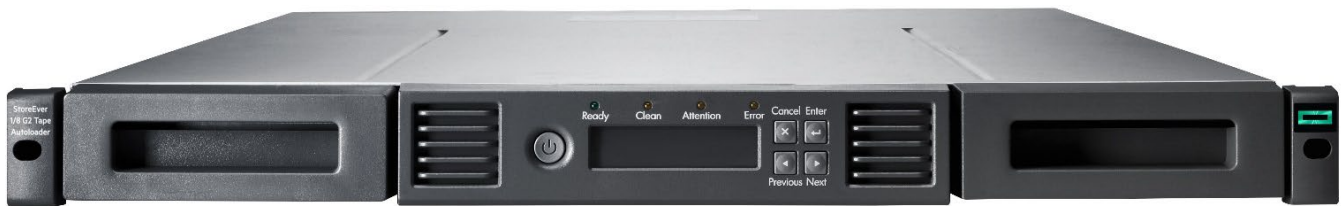
HPE StoreEver MSL 1/8 Tape Autoloader

Quickly and simply manage the tape media both in and out of the library with the standard bar code reader, configurable mail slots, and removable magazines. If a tape were lost or stolen, protect important business data from unauthorized access with data encryption options. MSL investment protection and uncertain data growth are easily managed within the MSL library portfolio. Quickly increase capacity and/or performance with tool-free drive upgrades in the MSL 1/8 Tape Autoloader or MSL2024 Tape Library, or move tape drive kits to the MSL3040 or MSL6480 for library scalability and additional enterprise class features. Proactively receive detailed information about your MSL Tape Automation with HPE StoreEver TapeAssure Advanced, a licensed feature of CVTL. Information about the library, drives, and media are all monitored for utilization, operational performance, and life and health information. Prevent problems before they occur by proactively receiving notification if any library, drive or tape media parameters fall below Hewlett Packard Enterprise recommended standards.