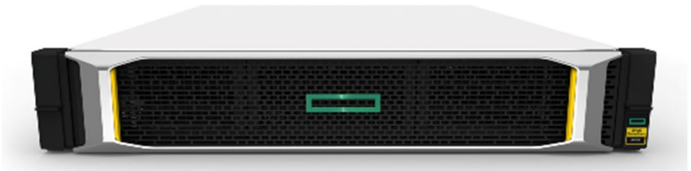
HPE MSA 1050 SAN Storage

Notes: *US Street Price (MSA 1050 base unit, dual 1GbE iSCSI controllers, four 300GB HDDs); prices are subject to change without notice.