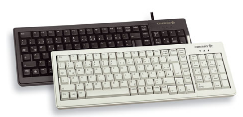
Models may vary from the image shown