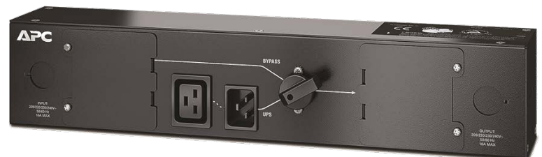
[ SBP3000RM ]

SBP3000RMHW: APC Service Bypass Panel, 100 - 240 V; 30 AMP ; BBM; Hard-wire Input/Output