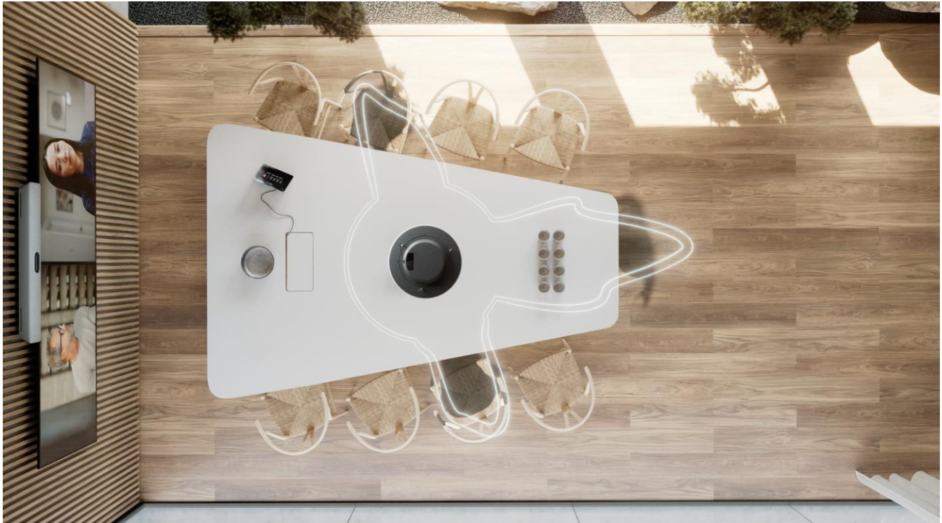
Figure 5. Adaptive beams tracking and capturing in-room participants' voices in a medium meeting room.