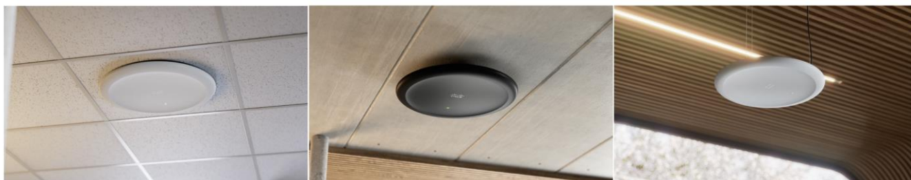
Figure 4. Ceiling Microphone Pro mount options: drop ceiling grid mount, ceiling bracket mount, and wire hanging ceiling mount.