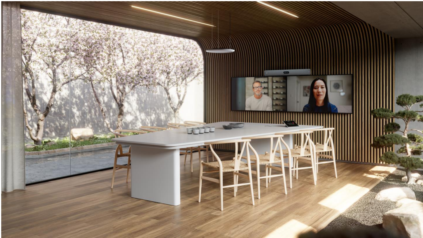
Figure 1. The Ceiling Microphone Pro in Arctic White with optional wire hanging mounting kit.

Cisco Ceiling Microphone Pro is an intelligent conferencing microphone device designed to capture clear, high-fidelity sound in meeting rooms, boardrooms, training rooms and multi-purpose spaces. It supports your modern and flexible workspace layouts with AI adaptive beamforming that intelligently picks up active speakers' voices while following room dynamics and design changes. Better still, this ceiling microphone allows for rapid setup via zero-touch configuration, scalable IP connectivity, embedded signal processing, and versatile mounting options.