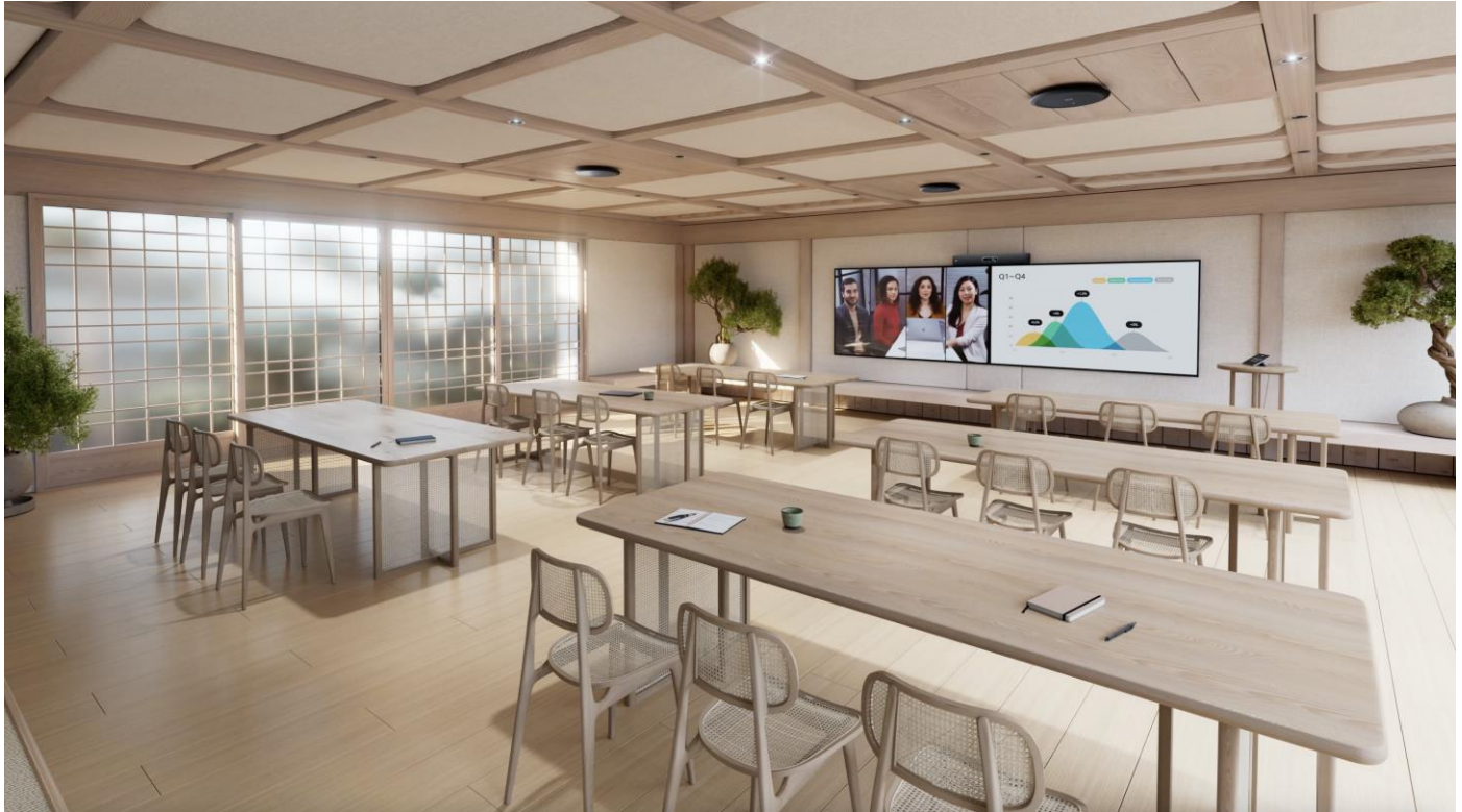
Figure 2. The Ceiling Microphone Pro in Carbon Black with optional ceiling bracket mounting kit.