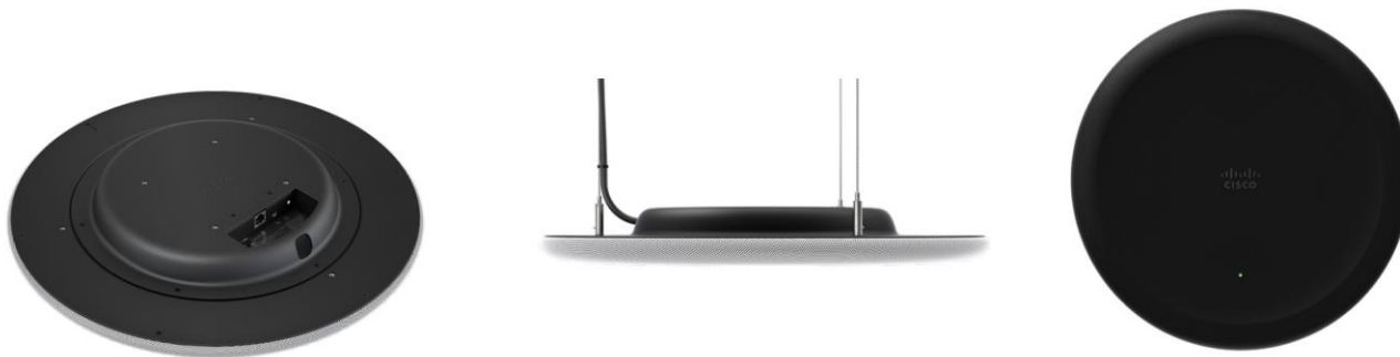
Figure 3. Ceiling Microphone Pro I/O area and rear panel, side view with wire hanging mount kit, and front grille with status LED.