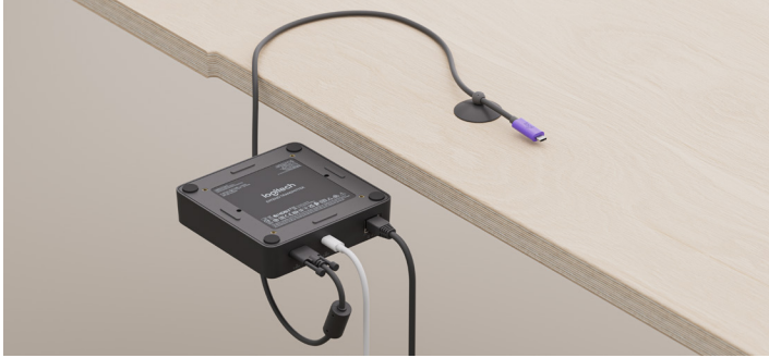
Optional USB-C power delivery

Extended reach with a standard category cable