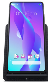
Dell Dual Dock - HD22Q

Experience industry leading video quality and picture clarity in any lighting with this intelligent 2K QHD webcam.