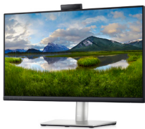
Dell 24 Video Conferencing Monitor - C2423H

Stay in sync on a 24-inch FHD monitor with built-in conferencing essentials, low blue light and an eco-friendly design.