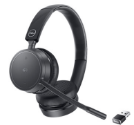
Dell Pro Wireless Headset - WL5022

Powerfully productive, this compact dock is the world's first laptop docking station with a wireless charging stand for Qi-enabled smartphone or earbuds.