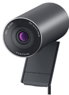
Dell Pro Webcam - WB5023

Stay productive, no matter where you work. Reduce harmful blue light with this sleek 23.8-inch FHD hub monitor with ComfortView Plus.