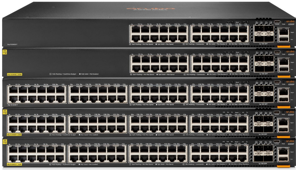
HPE Aruba Networking CX 6200 Switch Series

Aruba Dynamic Segmentation extends Aruba's foundational wireless role-based policy capability to Aruba wired switches. What this means is that the same security, user experience and simplified IT management can be enjoyed throughout the network. Regardless of how users and IoT devices connect, consistent policies are enforced across wired and wireless networks, keeping traffic secure and separate.