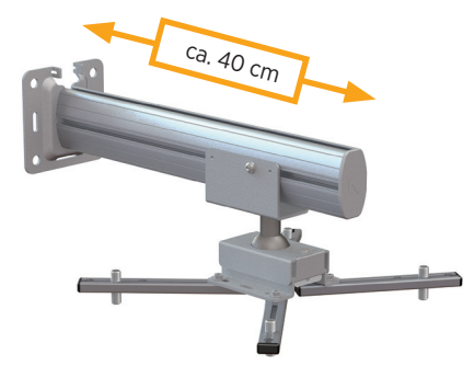
Kindermann Premium W