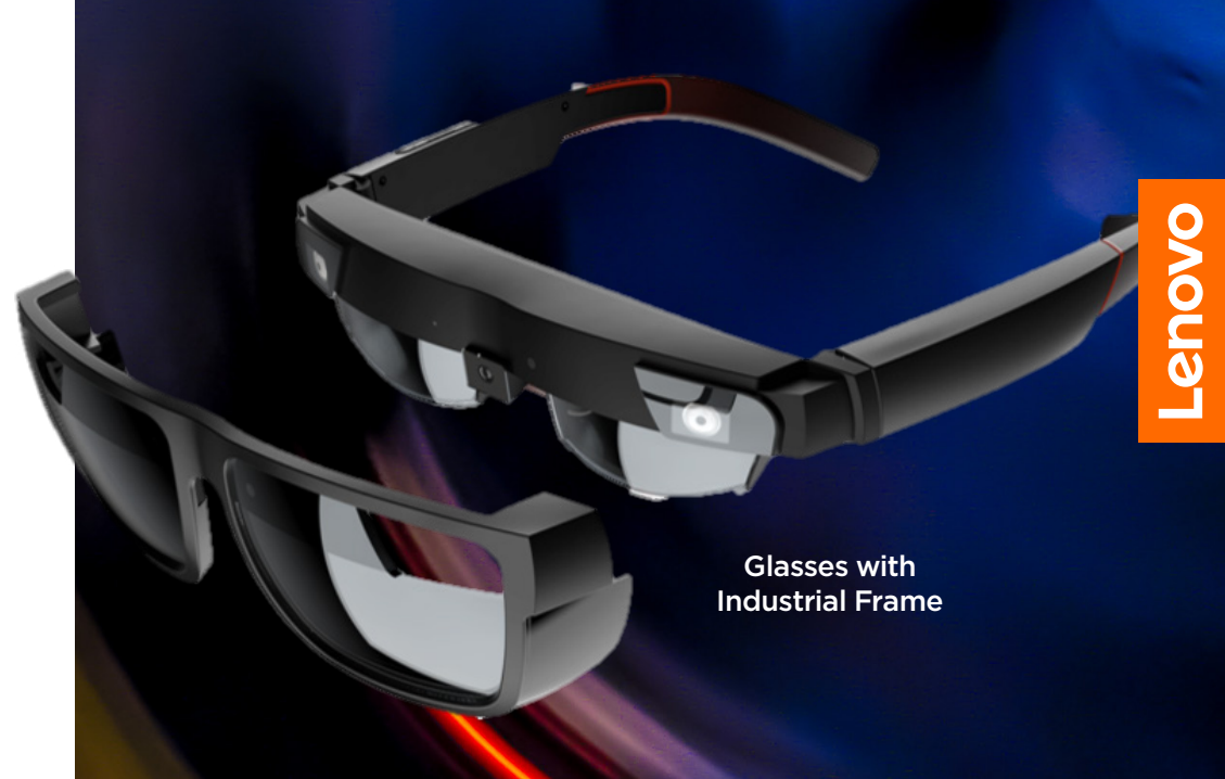
Glasses with Industrial Frame

The ThinkReality A3 is one of the most advanced and versatile enterprise smart glasses to come to market and is part of a comprehensive digital solutions offering from Lenovo.