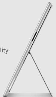
Lightweight and ultra-thin portability at 1.98lbs