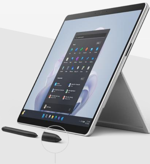
Surface Slim Pen 2 is always ready with wireless charging built into Surface Pro 9 Signature Keyboard

Security has never been more important; it's also never been easier with Surface Pro 9 and Microsoft SQ® 3. Pluton architecture secures sensitive data directly in the CPU, making it more difficult for attackers to access.