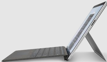
Adjust to the perfect angle with the built-in kickstand